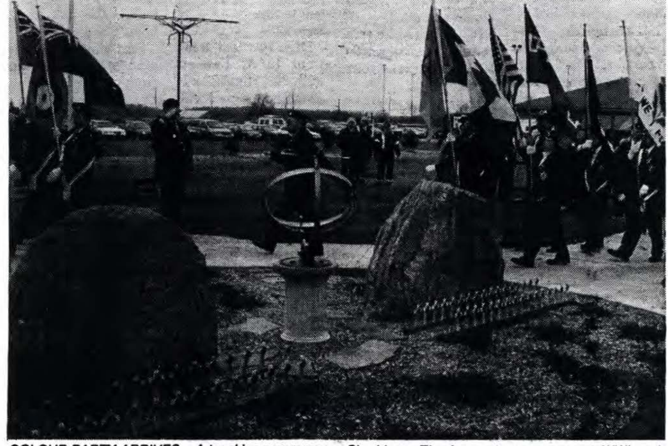
COLOUR PARTY ARRIVES – A touching ceremony was held November 12th when the War Memorial